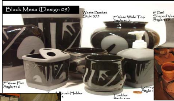
Black Mesa (Design 09)