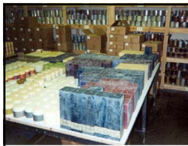
Candles Are Hand Poured