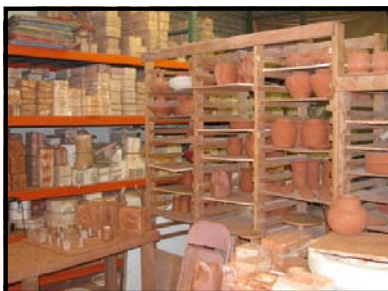
Work In Process

*Cashflow numbers are projections for 2010 based on annualized actual 2009, with a new marketing capability in place, Growth projections have been adjusted downward due to the Sellers need to focus on operational aspects without the marketing support of the former partner.