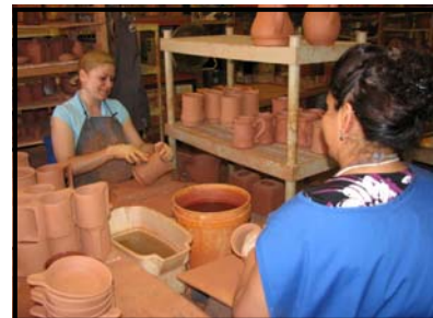
Ceramics Are Hand Finished

Email: Info@Havelock-Adams.com / Fax: 623.544.1220 / Ph: 602.881.6703