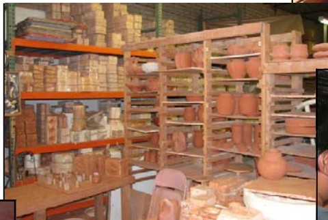
Work In Process